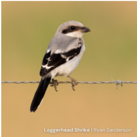
Loggerhead Shrike

Additional details can be found at the patokarefugefriends.org/happenings website and Friends of the Patoka River NWR Facebook page as they become available.